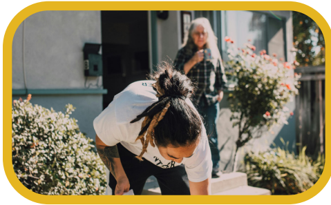
LEND A HAND: See if your neighbours need help with their yard work or gardening for a donation.