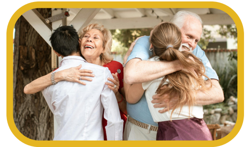
FAMILY LOVE: Share your project and ask your family to support an important cause.