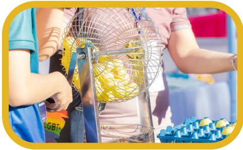
KEEPIN' IT LOCAL: Work with a local business to get donations for a raffle or auction. Sell tickets and donate the proceeds.