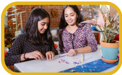
IT'S HANDMADE: Sell things you make, like artwork, crafts, jewelry, or other handmade items. Send us pics and details of your items and we'll help you reach more people!