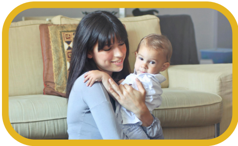
CARE FOR A CAUSE: Pet sit, house sit, or babysit for a friend or family member and donate your earnings.