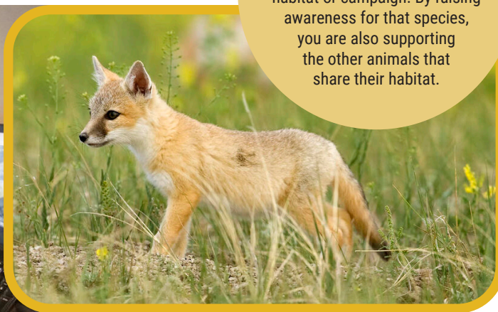
Peter Soroye, Wildlife Conservation Society Canada, protects swift fox habitat in Saskatchewan