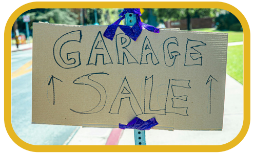
YARD SALE: Sell clothing or other items you don't need (and keep them out of landfills!)