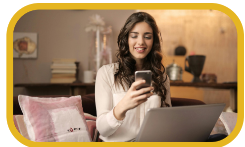
@ YOUR FOLLOWERS: Use your social media powers to gain support from friends and followers Tag us! @earthrangersorg (TikTok) @er.teens (Instagram) | #ERTEENS