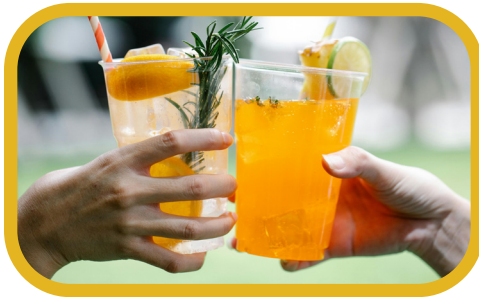
TAKE A "STAND": Host a lemonade stand, iced tea stand, or ice cream stand for hot summer days.