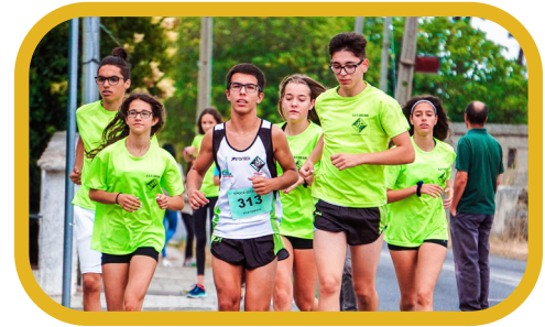
HOLD A "-THON": Host a walk-a-thon, bike-a-thon, or marathon to raise money (talk about sustainable transportation!)