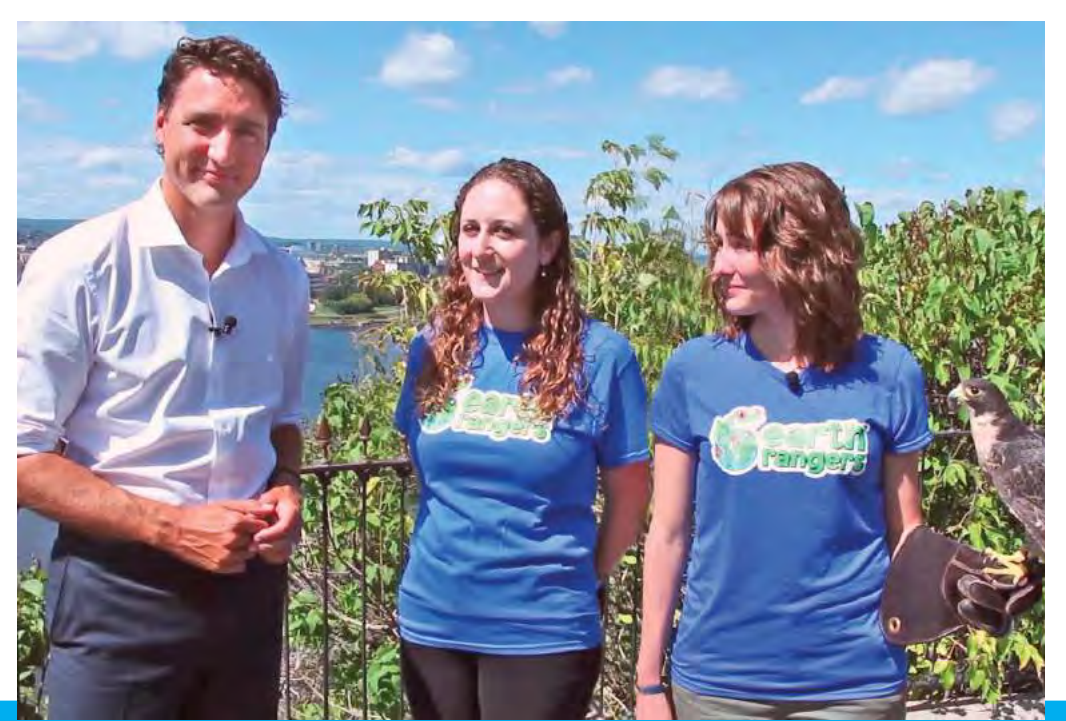
"I don't want you to think of yourselves as leaders of tomorrow; I want you to understand that you are leaders today, right now. What you do matters in the world." – Justin Trudeau, PM of Canada

We're all about giving kids authentic and positive role models who will help to shape their perception of what it is to dream big, to be compassionate, and to take control of their future and the future of the planet.